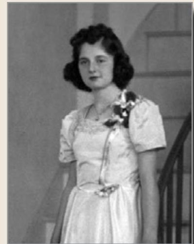
Eighth Grade Graduation