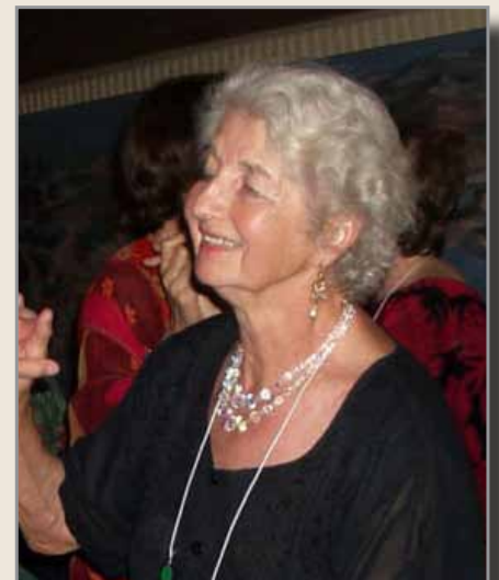
Dancing, in her late 70's